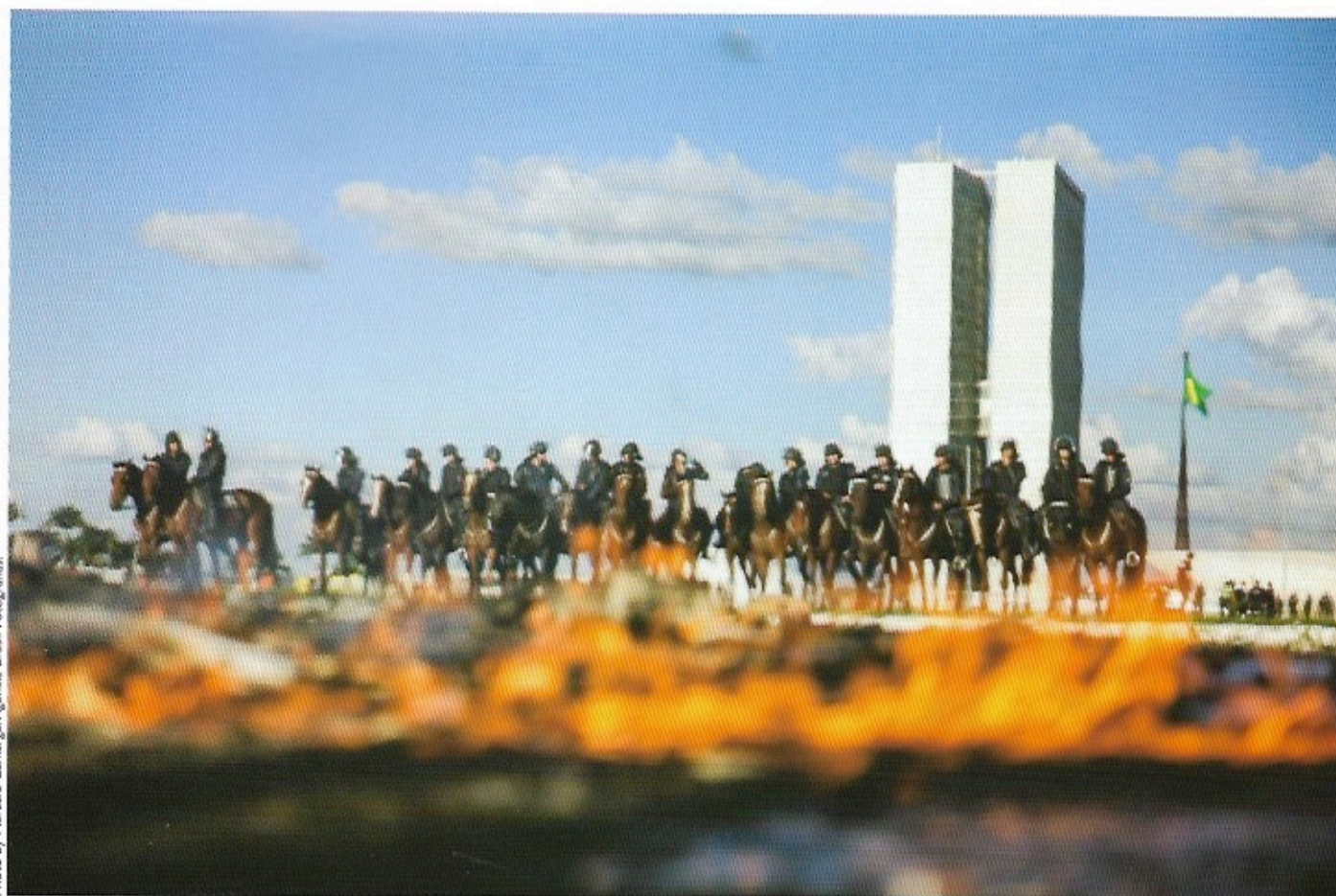
Mounted police at an anti-government demonstration during votes overturning progressive policies on worker rights and pensions, May 2017.

held meetings with the chairman and ranking member of the Senate Committee on Foreign Relations, Bob Corker (R) and Ben Cardin (D), respectively. He then attended a luncheon organized by Albright Stonebridge Group. How should one interpret all these meetings being held a day or two after the April 17 vote in the Brazilian National Assembly? Does this reveal the bias of U.S. decision-makers toward one side of the dispute?