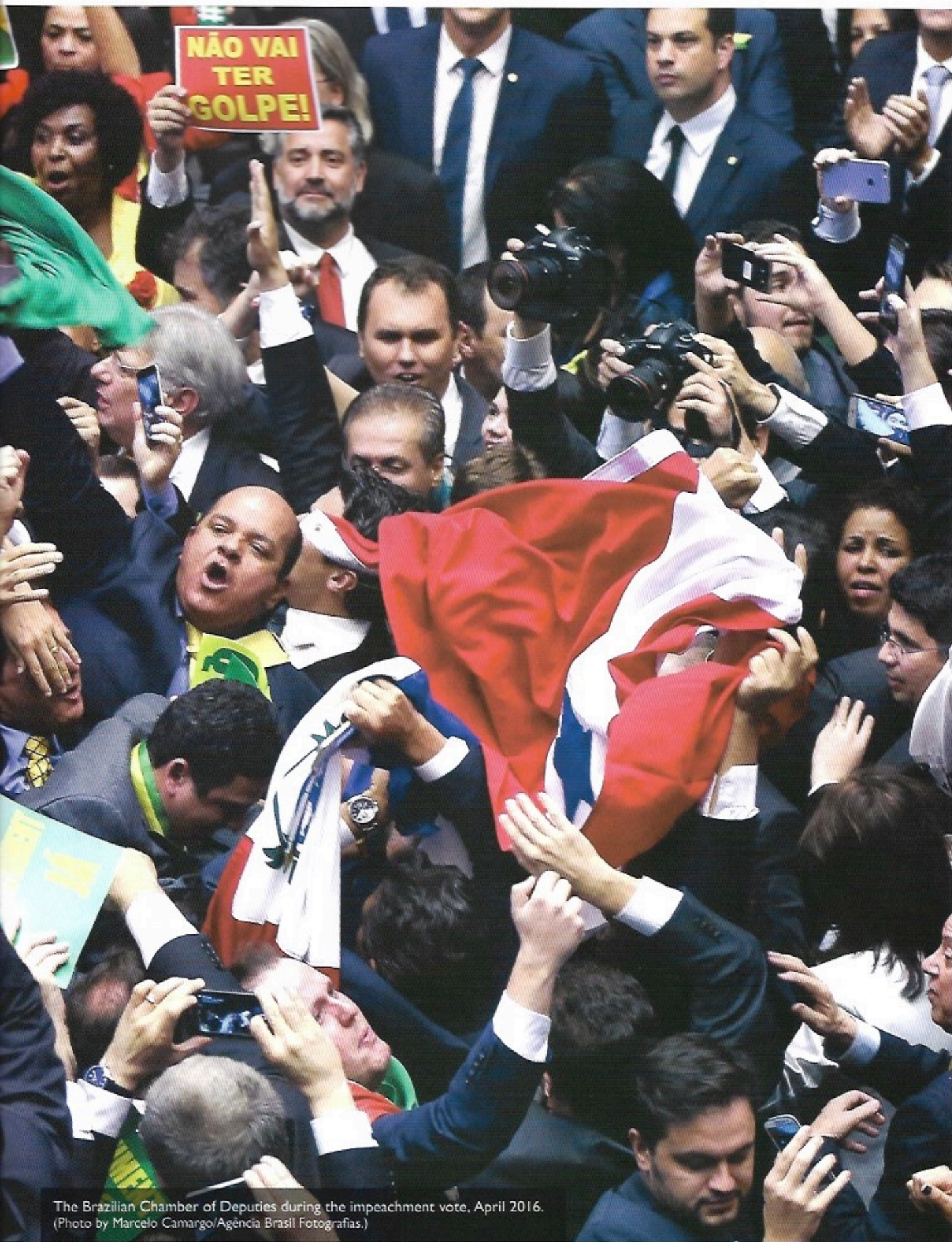
The Brazilian Chamber of Deputies during the impeachment vote, April 2016.